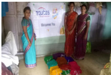
AFTER ATTENDING EKG SKILL TRAINING, MEMBER FROM ICHALKARANJI EARNS ADDITIONAL INCOME BY STITCHING & SELLING PETIKOTS