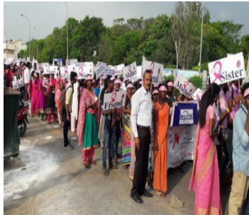
BREAST CANCER RALLY ALONG WITH "CAN STOP" AT BESANT NAGAR