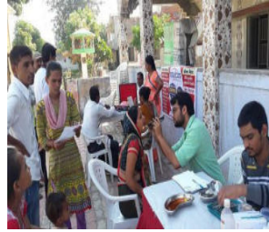
DENTAL SCREENING CAMP AT BAPU NAGAR