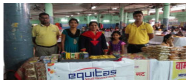
AFTER ATTENDING EKG SKILL TRAINING, MEMBER FROM SHIVAJI NAGAR BRANCH STARTED PREPARING PERFUME. ETC & PUT UP STALL WITH HER PRODUCTS AT THE MAHILA BACHAT GAT EXHIBITION .