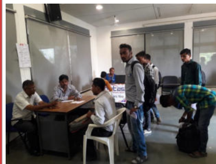
JOB FAIR AT KHEDA