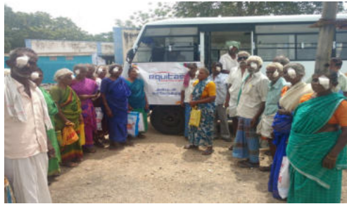
62 PATIENTS IDENTIFIED WITH CATARACT GROWTH IN THE EYE CAMPS ORGANIZED BY EQUITAS, WERE OPERATED FREE OF COST, BY PARTNERING WITH ARASAN EYE HOSPITAL & ARAVIND EYE HOSPITAL AT DINDUGUL