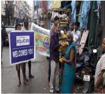
DEEPAVALI SWEET DISTRIBUTION ALONG WITH RAJASTHANI ASSOCIATION FOR EBN FAMILIES