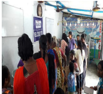
GENERAL HEALTH CAMP AT PALLAVAN NAGAR ALONG WITH MURUGAN MULTISPECIALITY HOSPITAL FOR EBN FAMILIES