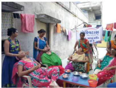
BEAUTICIAN TRAINING AT BAPUNGAR

1804 members located across India benefitted through five day skill training like Beautician Training, Tailoring, Embroidery, Pach Rangoli design making....etc. These training facilitates members to earn additional income. Along with the skill trainings, these women were provided health education, developed and supported by "Freedom from Hunger", USA. Through this health education women are being taught the importance of preventing them from non communicable diseases.