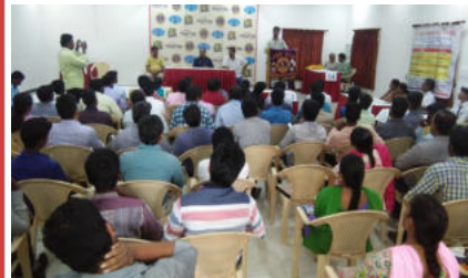
MEGA JOB FAIR AT COIMBATORE

Equitas conducts job fair for the unemployed youth and has helped 4265 youth to get job offers in the month of Oct 2017 . Cumulatively has helped 118565 youth to get employment opportunities so far.