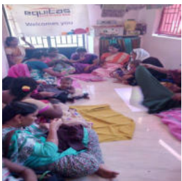
TAILORING TRAINING AT ARYAMANGALAM