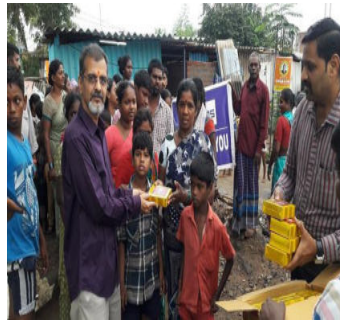
ALONG WITH RAJASTHANI ASSOCIATION FOR EBN FAMILIES