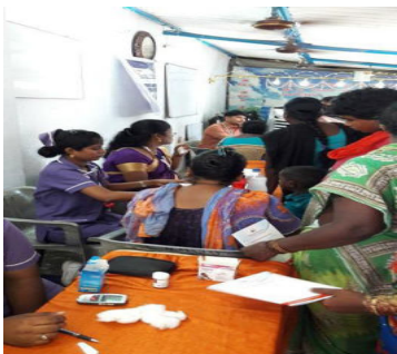
GENERAL HEALTH CAMP AT PALLAVAN NAGAR ALONG WITH MURUGAN MULTISPECIALITY HOSPITAL FOR EBN FAMILIES