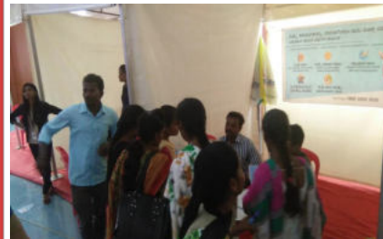
JOB FAIR AT CHITRADURGA