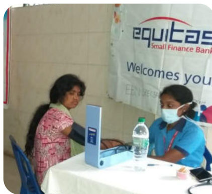
Health Screening camp in association ACS Medical college Hospital