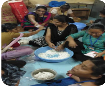
During Diwali season Equitas staff from 4 branches belonging to Kholapur area purchased 60 Packs of Diwali Products like Mercury, Candle, Sky lantern, product for LaxmiPooja & Diwali cosmetics from Chetana Vikas physical & Mentally handicapped school children.