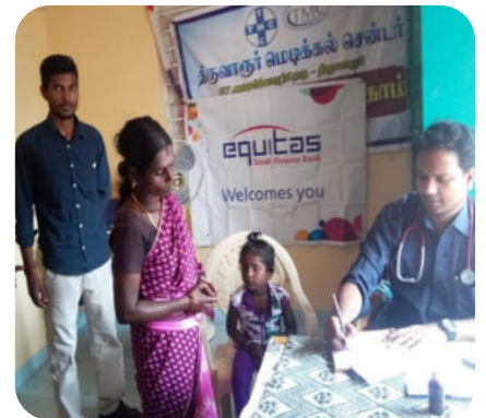
Health camp at Thirunaipur village, Thiruvarur for the victims of Gaja Cyclone.