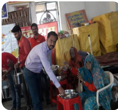
Joy of Giving at Anand nagar & Vidisha branch, Bhopal