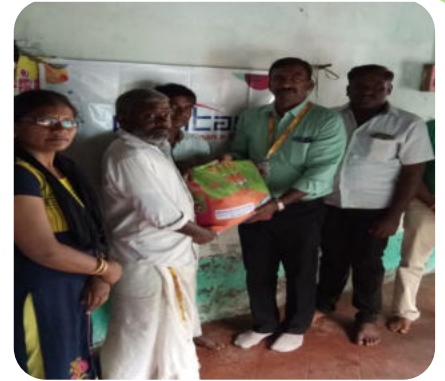
Vedharanyam Branch team contributed rice bags to Gaja cyclone affected families