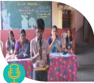
An office bearer is seen taking up an oath in the presence of Academic Advisor and the Principal in Equitas Gurukul, Coimbatore.