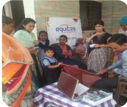
Eye Camp at Pune