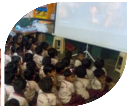
Kindergarten students of Equitas Gurukul Dindigul watching and enjoying the animation movie 'Ice Age'