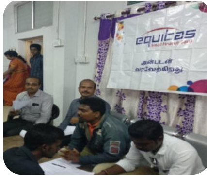
Job fair conducted at Coimbatore