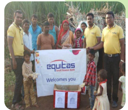
Rajarampuri team gave Diwali snacks, clothes to Anadha Ashram located in Kolhapur