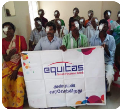
Cataract surgeries were done free of cost to 103 persons , referred from health camps ,organized at Dindigul with ArasanEye Hospital . Amount saved , Rs. 154500