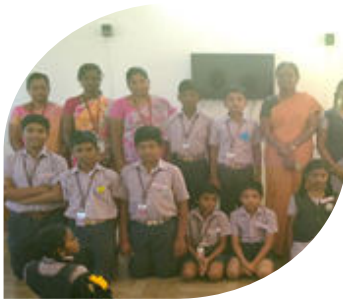
The office bearers with the Principal and the teachers in Equitas Gurukul, Kumbakonam