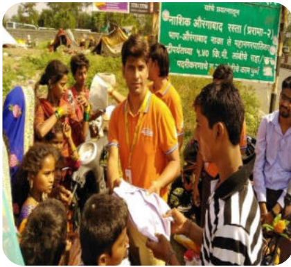
Nashik team gave Diwali snacks, clothes to Tapovan community and Jain Gurukul Anadh Ashram located in Nashik

Employees at Equitas actively take part in donation drives and activities. Teams across the country come together and contribute provisions and necessary material for people in need.