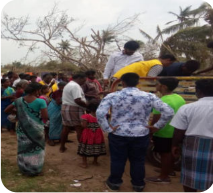
Provided Lunch for 1000 persons at Sithampur, Tirukkoyilur