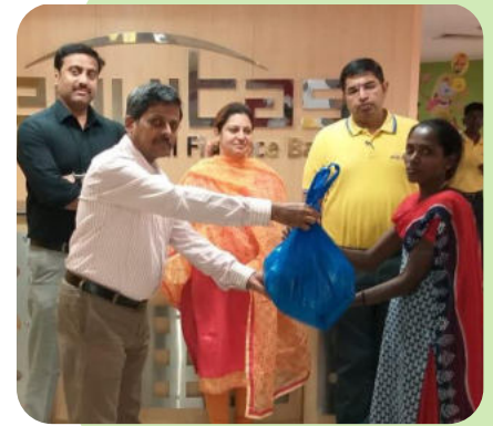
Joy of Giving at Head office to EBN Members