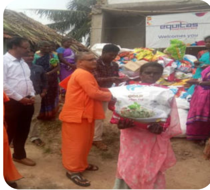
Thiruthuraipoondi branch team distributed relief materials Rice ,Dhal ,Oil ,Candle, Mosquito Coil, Sanitary Napkin , Bed Sheets to 120 families affected by Gajacyclone