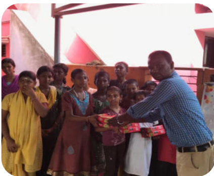
Tirunelveli area team gave pillows, bed sheets, sweets, stationeries to orphaned children living in Anbu Illam located in Konda Nagaram