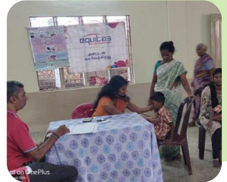
Pediatric Screening camp at Chennai