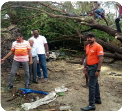
Rescue work at Gaja cyclone affected areas at Sithaimoor,Thiruvaraur