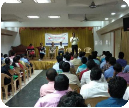
Job fair conducted at Kilpauk

Equitas conducts jobfair for the unemployed youth to get employment opportunities, this helps the unemployed youth to pick & choose the job he/she likes. A regular path is created for the job seekers to continue their career, and uplift their social status.