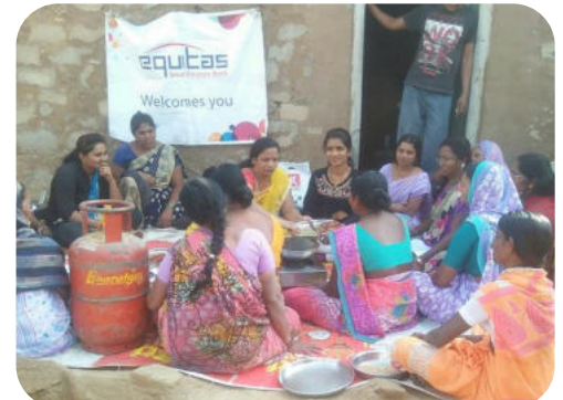
Masala Making training at Pune