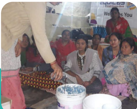
Washing Powder preparation training at Bhopal

Equitas strives for the enhancement of quality of women's lives by providing skill trainings and empowering them to earn supplemental income. This also gives economic independence to women and ensures their participation in the economic development of our nation.