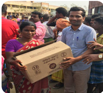
Erode & Coimbatore Area teams distributed Rice ,Oil, Dhal ,Bed Sheet, Dress Material, Biscuits , Sanitary Napkin, Pampers, Candle , Mosquito Coils to 380 families affected by the cyclone Gaja