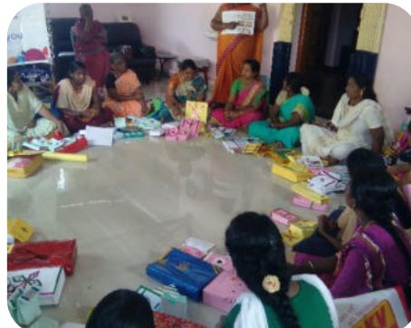
Chudithar cutting training at Tirunelveli