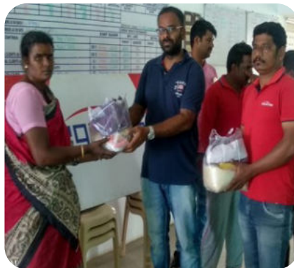
Dindigul Area team distributed Rice ,Oil ,Biscuits ,Dhal, Bed sheets to 320 families affected by the cyclone Gaja