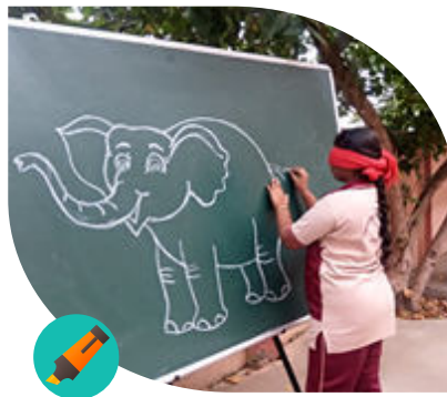
A student in Equitas Coimbatore participating in an event

In fond memory of our First Prime Minister Pandit Jawaharlal Nehru, our Equitas Gurukul schools celebrated the Children's Day on the 14th of November. The excitement of the children was in air as all the events were organized by the teachers and were fun filled. The day was highly eventful and children enjoyed it.