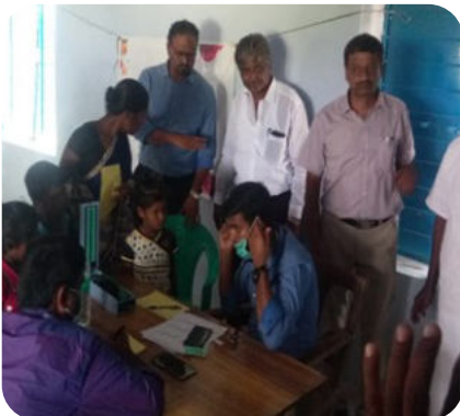
Health Camp at Periyakovil pathu, from Vedaranyam branch