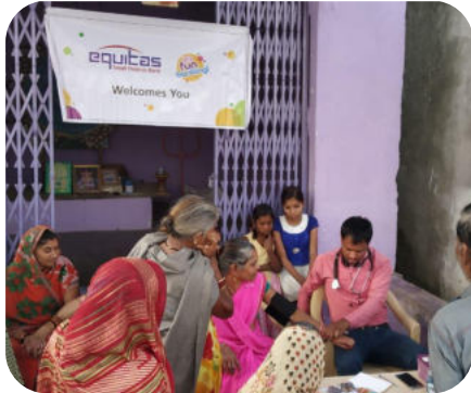
General Health Camp at Indore

By facilitating early detection of diseases through screening camps as well as by helping through secondary care to reduce the treatment cost, Equitas helps communities hailing from the "Bottom of Pyramid" to get rid of the burden of spending huge portion of their hard earned money on health problems.