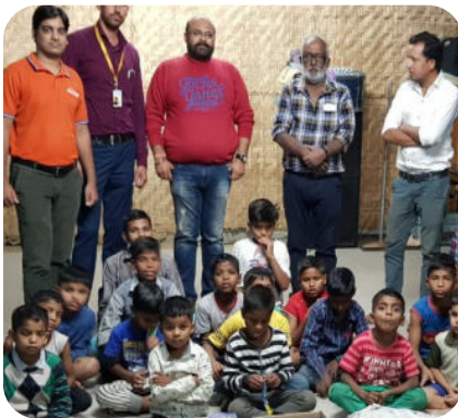
Jaipur Team at Surman Sansthan distributed fruits, clothes stationeries, chocolates to Orphaned children.