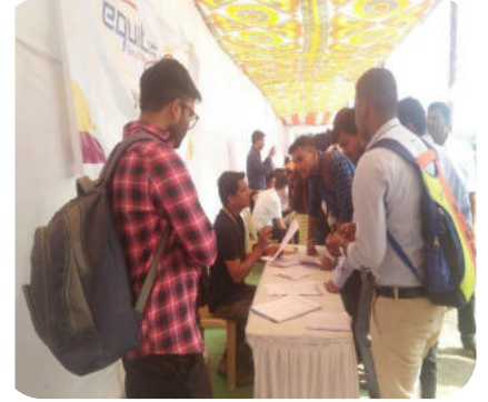
Mega Job fair conducted at Pune