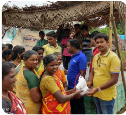
Dindigul area team gave Rice, Dhal , Biscuit, Rusk to people living near NVM College