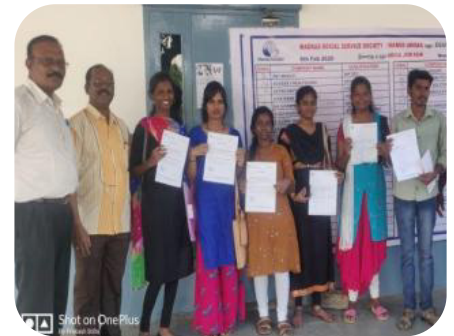
Job fair at Chennai