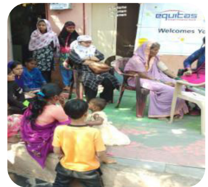
Eye checkup camp at Pune