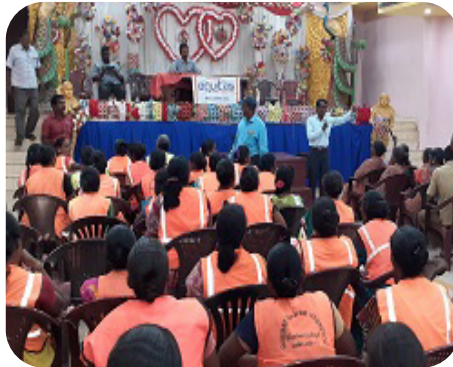
Waste Management Awareness Program Conducted along with Chennai Corporation Zone 1 and Exnora International