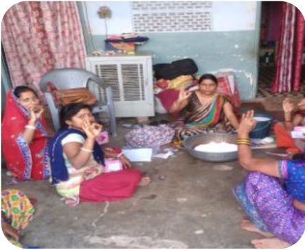
Washing powder making at Jaipur

Equitas strives for the enhancement of quality of women's lives by providing skill trainings and empowering them to earn supplemental income. This also gives economic independence to women and ensures their participation in the economic development of our nation.