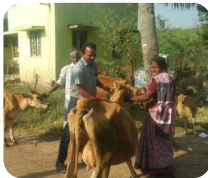
Veterinary camp at Kumbakonam