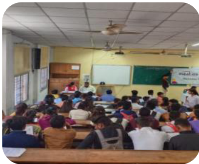
Mega Job fair at Jabalpur

Equitas conducts jobfair for the unemployed youth to get employment opportunities, this helps the unemployed youth to pick & choose the job he/she likes. A regular path is created for the jobseekers to continue their career, and uplift their social status