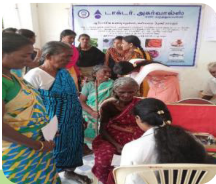
Eye checkup camp at Tirunelveli

By facilitating early detection of diseases through screening camps as well as by helping through secondary care to reduce the treatment cost, Equitas helps communities hailing from the "Bottom of Pyramid" to get rid of the burden of spending huge portion of their hard earned money on health problems.