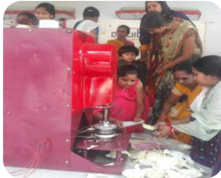
Paper bowl making training at Indore