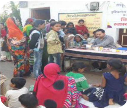
General Health Camp at Jabalpur