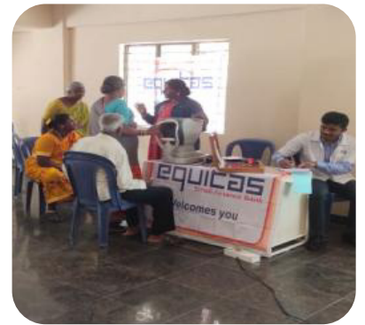
Eye camp at Bangalore