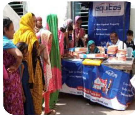
Eye checkup camp at Rajkot