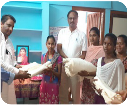
Cloth Bag Project Opening Ceremony along with Utkarsh Foundation at Nalvazhu Maiyam Perumbakkam