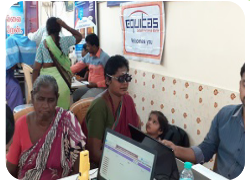
Eye and Acupuncture Screening Camp