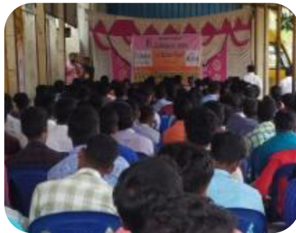
Job fair at Villupuram