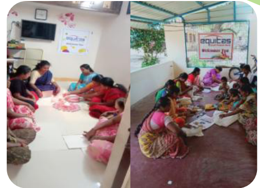
Candle making training at Chennai