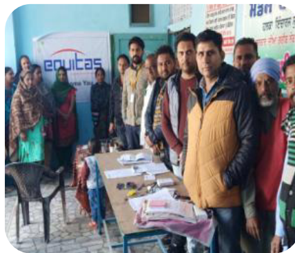
General health check camp at Punjab