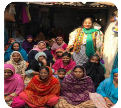
Gariyali ma'am visited some success stories