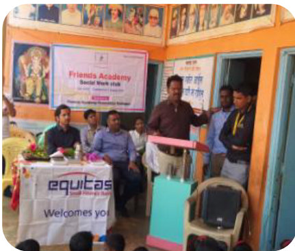
Library Started at Kolhapur