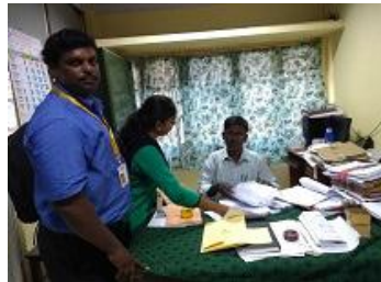
UNDER WIDOW PENSION SCHEME AND OLD AGE PENSION SCHEME AND POST OFFICE SAVINGS ACCOUNT OUR EBN MEMBERS AND THEIR FAMILIES WERE HELPED TO OPEN THEIR ACCOUNTS AND BENEFITED