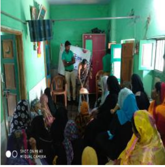
INTERNATIONAL WOMENS DAY WAS CELEBRATED BY CUTTING THE CAKE AT DINDIGUL AREA