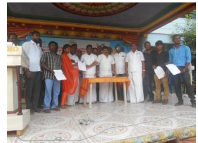
JOBFAIR AT MANALI

Equitas conducts job fair for the unemployed underprivileged youth and has helped 2165 youth to get job offers in the month of March 2018. Cumulatively has helped 131674 youth to get employment opportunities so far.