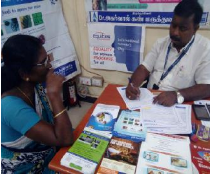
EYE SCREENING CAMP AT KARUTHAPILLAIYUR, TIRUNELVELI