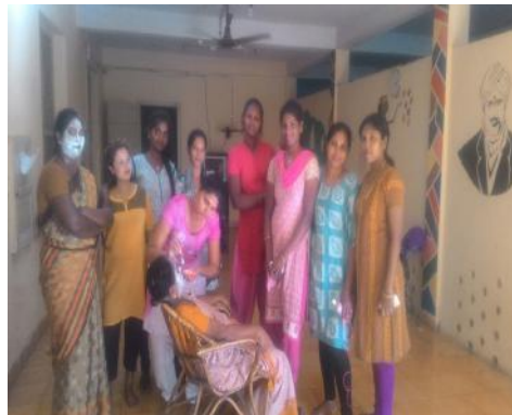
BEAUTICIAN TRAINING AT MYLAPORE, CHENNAI