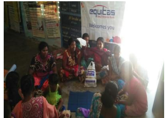
BLOUSE CUTTING TRAINING AT KATTUMANARKOVIL