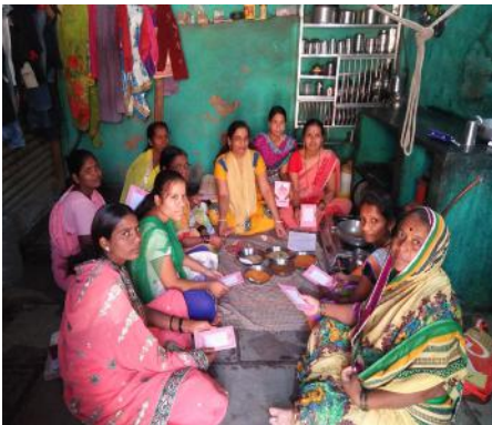
MASALA MAKING TRAINING AT BRANCH, PUNE

2183 members located across India, benefitted through five day skill training like Mat making, Beautician Training, Tailoring, Fashion jewellery making, Masala making....etc. These training helps members to earn additional income. Along with the skill trainings, these women were provided health education, developed and supported by "Freedom from Hunger", USA. Through this health education women are being taught healthy habits for life and the importance of prevention from non communicable diseases and its early detection.