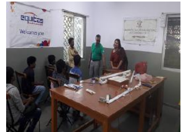
MUKTHI FOUNDATION 1ST MONTH STIPEND DISTRIBUTION TO TRAINEES