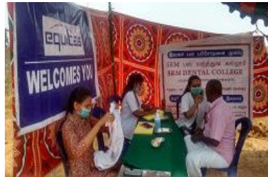
MULTI SPECIALITY CAMP AT MALANTHUR @VILLAGE - SPONSERED BY ROTARY IN ASSOCIATION WITH EQUITAS