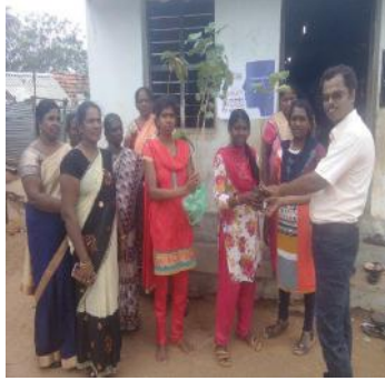
TREE SAPPLINGS WERE PRESENTED TO OUR MEMBERS AS A PART OF WOMENS DAY CELEBRATION AT THIRUNELVELI