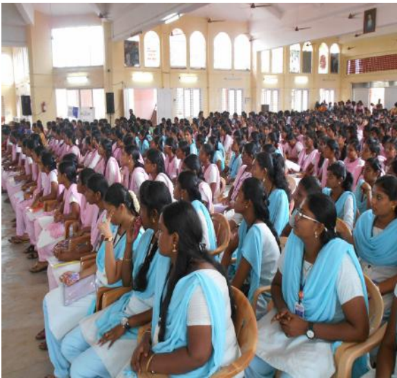
WOMENS DAY CELEBRATION AT THIRUNELVELI