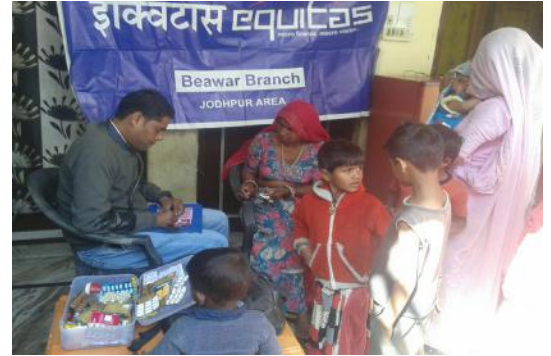
GENERAL CHECKUP CAMP AT JODHPUR

34371 persons, including member families benefitted through medical camps conducted across India by partnering with various hospitals. 16114 Members were screened in eye camps. 90 persons underwent free cataract eye operations and 640 nos. of spectacles distributed at free of cost.