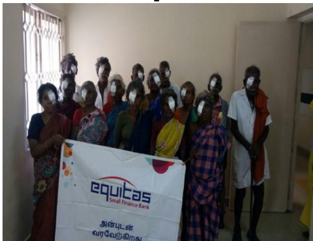
EYE SCREENING CAMP WAS CONDUCTED AT DINDIGUL , AND 213 MEMBERS WERE SCREENED AND OVER 25MEMBERS UNDERWENT CATARACT SURGERY FREE OF COST