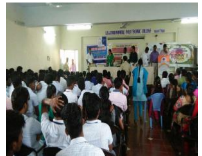
JOBFAIR AT NAGAPPATINAM