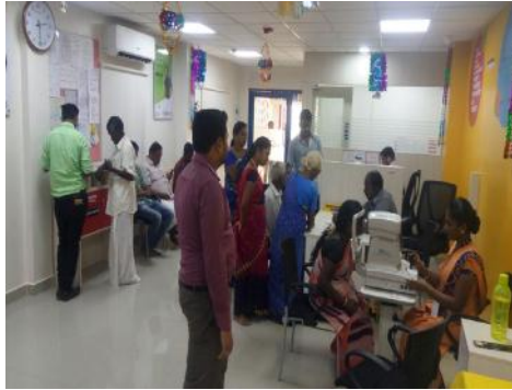
EYE CAMP AT KUMBUM LIABILITY BRANCH