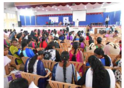
JOB FAIR AT DINDIGUL