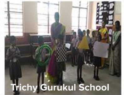
Trichy Gurukul School