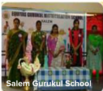
Salem Gurukul School

Equitas Gurukul Schools Organized Sadhana - a talent exploration contest at Salem and Trichy and were successful in discovering innumerable young talent across schools in Tamil Nadu. Sadhna aims at bringing out the competencies and skills of students in art, critical and logical thinking, general knowledge, current affairs public speaking, creative arts and performing arts. Among the plethora of competitions held the more interesting ones were dumb charades, OruvarthaiOruLakshyam, , speak up and dance.