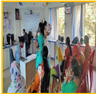
Cancer Awareness program at Pune