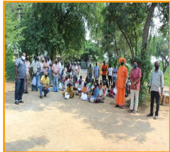
New clothes,Sweets,Medicines,Groceries and other daily essentials were given to 60 inmates in an Leprosy Rehabilitated centre at Salem