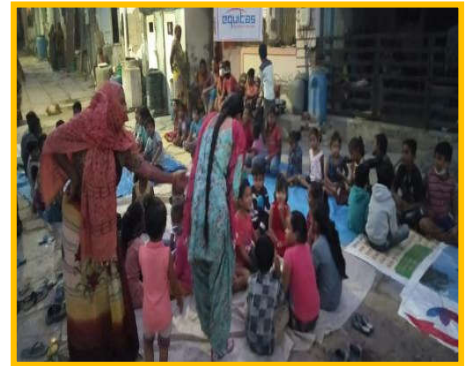
Sweets were distributed to orphanage children at Ahmedabad