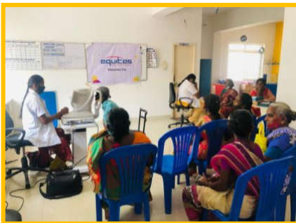
Eye camp at Dindigul

By facilitating early detection of diseases through screening camps as well as by helping through secondary care to reduce the treatment cost, Equitas helps communities hailing from the “Bottom of Pyramid” to get rid of the burden of spending huge portion of their hard earned money on health problems