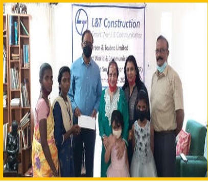
Scholarship was distributed to our EBN members children in Chennai

( Pavement Dwellers Rehabilitation Program)