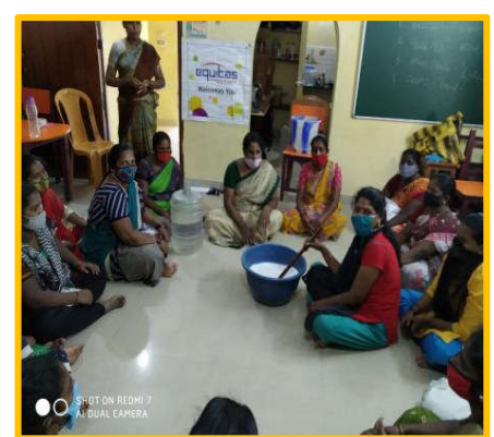
Chemical making training at Chennai