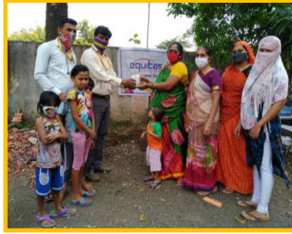
Tree Saplings distribution at Nashik