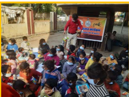
Stationery items & Snacks were distributed to the members Children in Bhopal