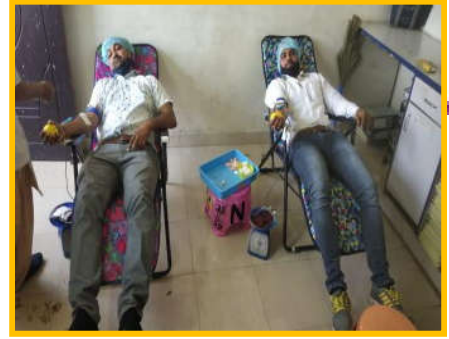
Blood donation camp at Amaravati