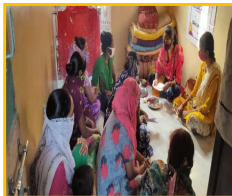
Masala making training at Pune