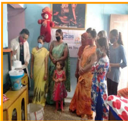
Cake making Training at Nashik

Equitas strives for the enhancement of quality of women's lives by providing skill trainings and empowering them to earn supplemental income. This also gives economic independence to women and ensures their participation in the economic development of our nation.