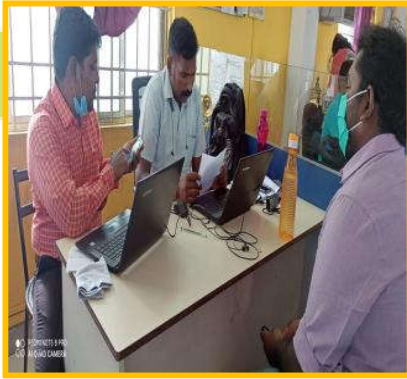
Jobfair at Chennai

Equitas conducts jobfair for the unemployed youth to get employment opportunities, this helps the unemployed youth to pick & choose the job he/she likes. A regular path is created for the jobseekers to continue their career, and uplift their social status.