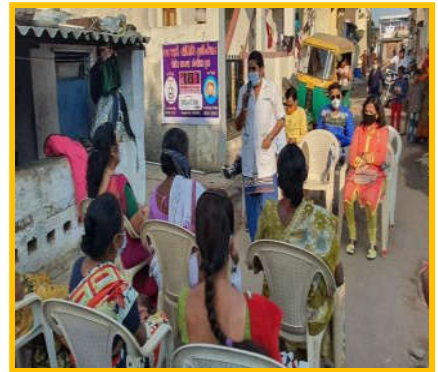
Women Development & Awareness program at Ahmedabad