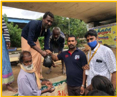
In Chennai, Food & Groceries Were distributed to the people affected in the Nivar Cyclone