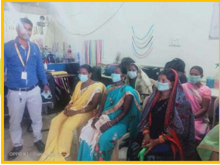
Facemask distribution to our members at Raipur