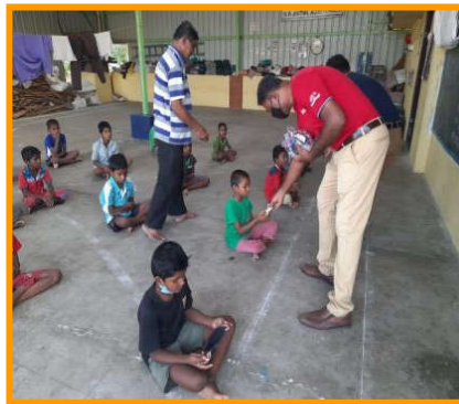
Sweets & Savories were distributed to Visually Challenged students at Salem