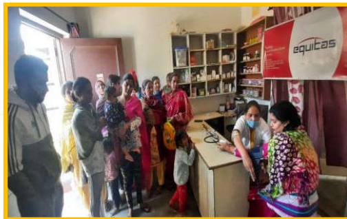
Health camp at Punjab