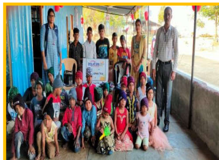
Socks & Caps were given to the children in the orphanage at Pune