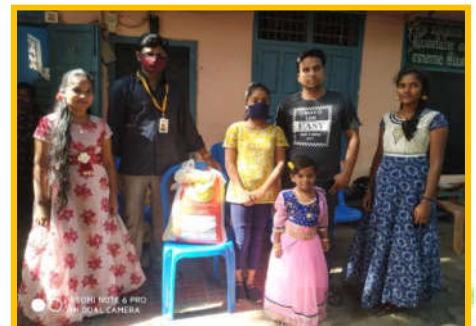
Sweets & Rice Bag was given to the children in Orphan at Chennai