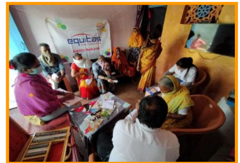
Health Camp at Amaravati