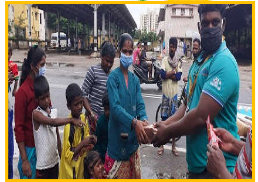
Food packets were distributed to the victims of Nivar cyclone in Ayanavaram