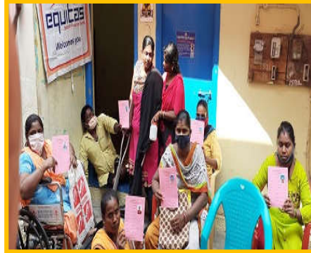
DAV Samrakshan Loan disbursement to PWD members in Kannagi Nagar, Chennai