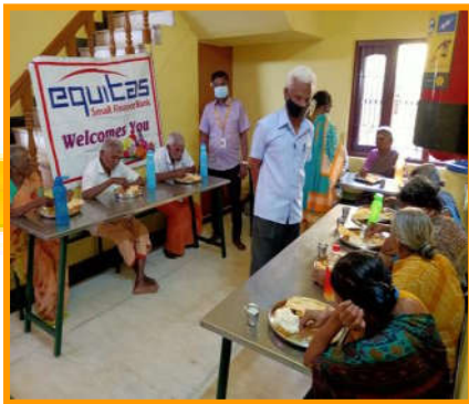
Lunch was distributed in an old age home at Trichy